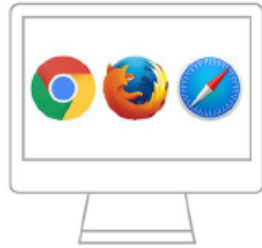
PC and Mac Chrome | Firefox | Safari